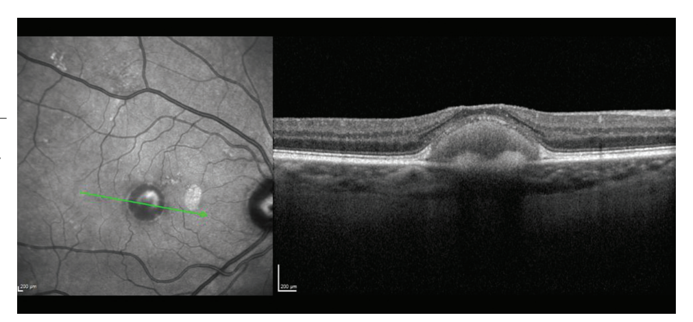
Figure 2 An infrared image (left) demonstrates the central vitelliform deposit seen in Figure 1. An optical coherence tomography (OCT) scan (right) demonstrates the vitelliform material and some thinning of the overlying outer retinal layers. The size of the deposit can be measured and tracked over time.

THE RETINA is a thin layer of light-sensitive nerve tissue that lines the back of the eye (or vitreous) cavity. When light enters the eye, it passes through the iris to the retina where images are focused and converted to electrical impulses that are carried by the optic nerve to the brain resulting in sight.